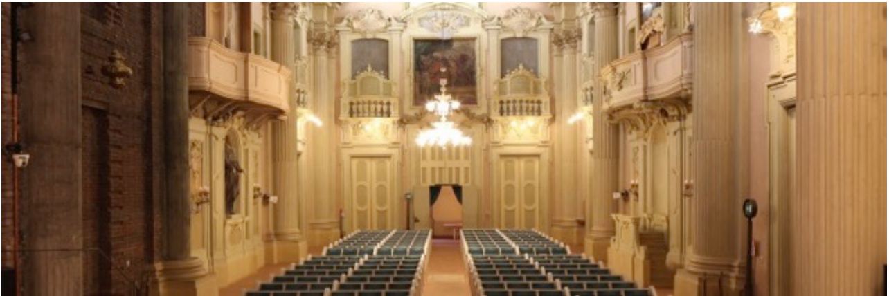
The Oratorio di San Filippo Neri is stunning historical site in the city centre of Bologna.